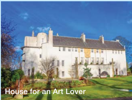
House for an Art Lover